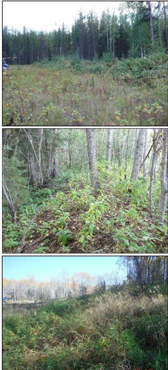
Figure 1. Examples of topsoil stockpiles left in place. Requirements and factors presented in this Information Sheet are used to determine if these are eligible to be left in place.

Reclamation practices in other industries to improve revegetation success such as the creation of microtopographic heterogeneity during reclamation in the mining and oil and gas industries and during site preparation in the forestry industry can have similar dimensions to soil stockpiles (Tokay et al., 2019). Although many of these examples are not directly comparable to soil stockpiles visually, the concept of variations in elevation created in reclaimed areas is comparable. At coal and oil sands mines, surface roughness (or “rough and loose” microtopography) is created during soil replacement by spreading topsoil unevenly or after placement by progressively digging holes with an excavator bucket and dumping the material beside and