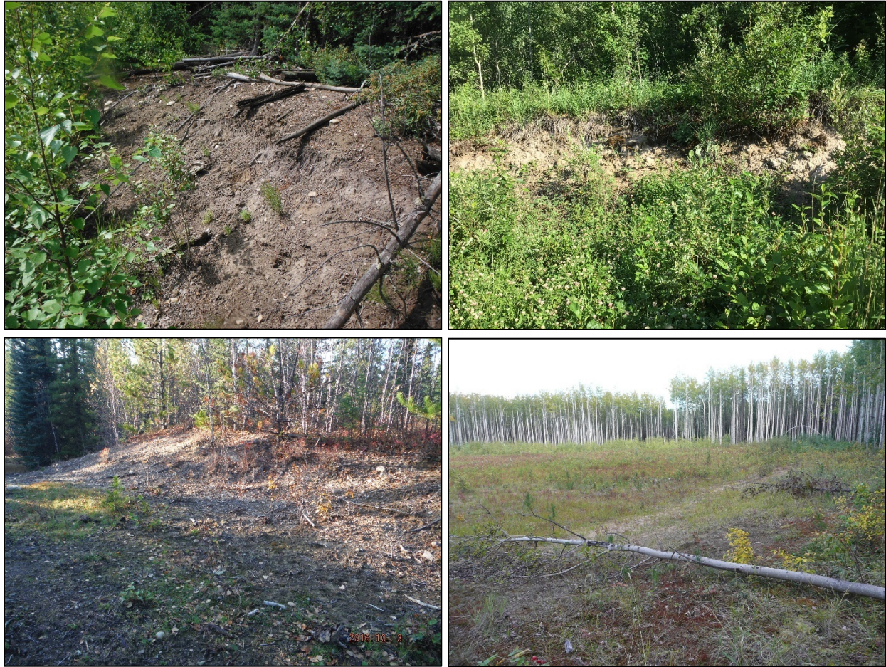
Figure 1. Examples of hill cuts. Requirements and factors presented in this Information Sheet are used to determine if these are eligible to be left in place.

Before proceeding through this Information Sheet, refer to Sections 1 and 3 to review the purpose and scope of the guidance document and the minimum requirements for variance approval. Variances are considered and accepted under exceptional circumstances and are not meant to provide an excuse or justification for not fulfilling reclamation obligations or lack of due diligence.