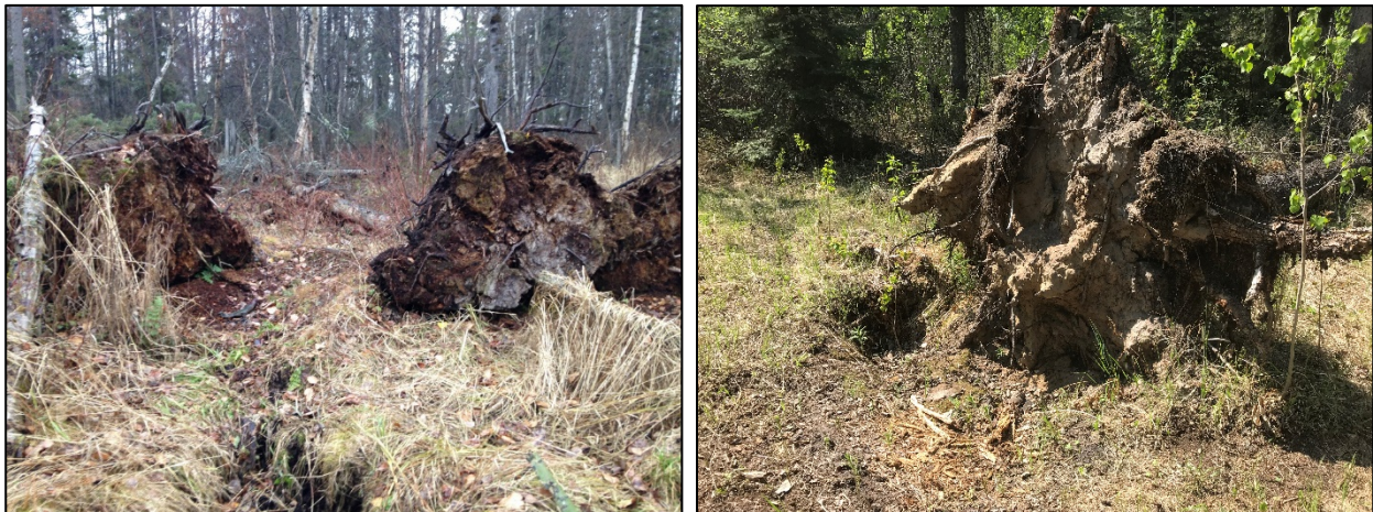
Figure 2. Windthrow mound and pit microtopography.

There are two main categories of microtopographical equivalents to subsided areas that can be examined for comparison purposes: naturally occurring variation in micro-contour within forests in the region or creation of microtopographic heterogeneity on reclaimed/reforested sites in other industries to improve revegetation success (Tokay et al., 2019). The most common natural analogs to subsided areas are natural depressions, windthrow pits (Figure 2) or beaver/muskrat runs. Windthrow pits can range from 15 to 55 cm deep, depending on the forest type (Kuuluvainen and Juntunen, 1998; Lee and Sturgess, 2002).