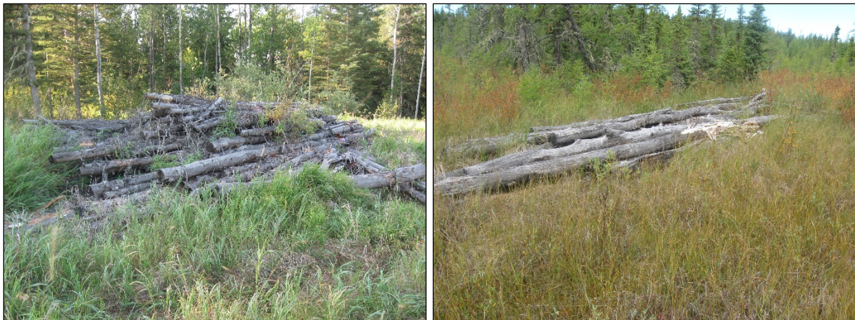
Figure 1. Examples of woody debris piles left in place. Requirements and factors presented in this Information Sheet are used to determine if these are eligible to be left in place.

Woody debris piles (also sometimes referred to as wood piles or log piles) left in place are often less than 1 m high but have been observed to range up to 2 to 3 m high (Acden Vertex Limited Partnership, personal communication 2019; Figure 1). Piles are typically along the edges of wellsites, on log decks or along the edge of access roads. Woody debris piles left in place can prevent vegetation establishment within the area occupied by the pile and can be considered a fire hazard if they encroach into the surrounding undisturbed forest and act as a ladder fuel (Alberta Environment and Parks, 2018a).